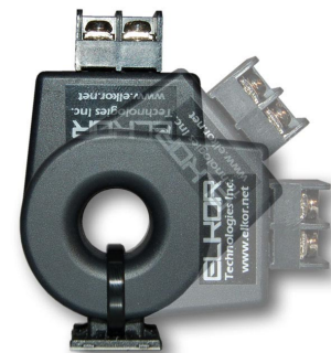
Mounting hardware for flexible surface mounting